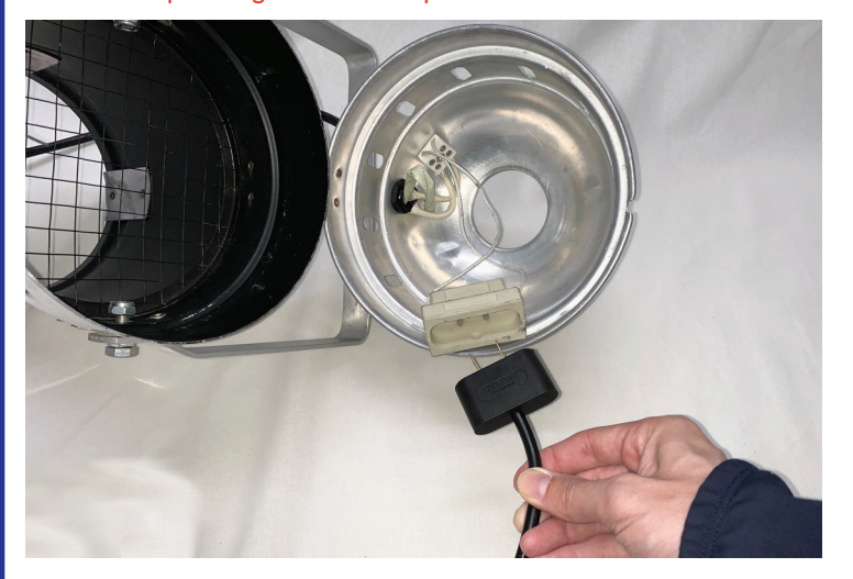
Complete Power Connection of Lotus Lamp to GX16D Socket