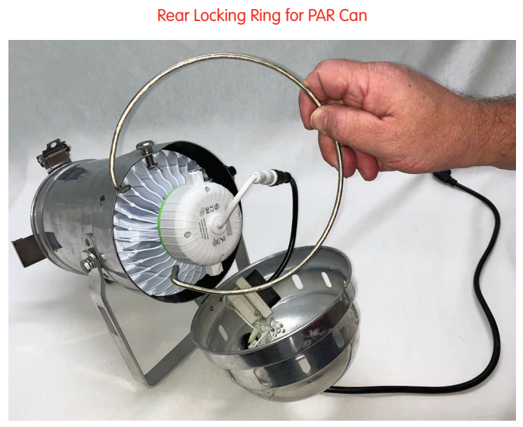
Step-6: Insert Locking Ring into PAR Can for Securing Lotus Lamp