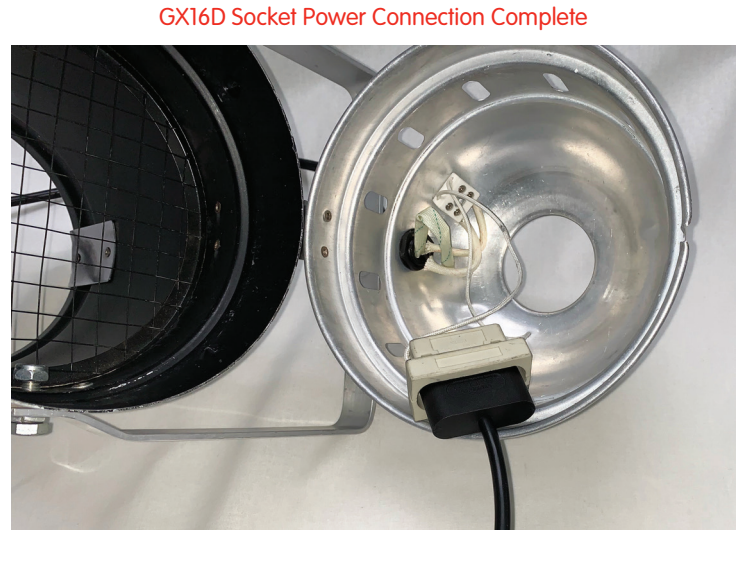
Step-5: Insert Lotus Lamp into PAR Can